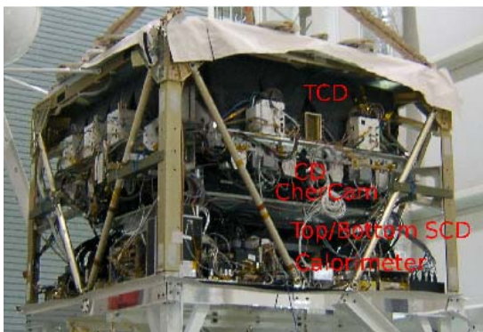
Figure 1: CREAM-III Instrument; From the top: TCD, CD, CherCam, top and bottom SCD, and Calorimeter.

The CREAM-III payload was launched from Williams field near McMurdo station, Antarctica on December 19, 2007 and the payload landed on January 17, 2008 after \sim 29 days of flight. Throughout the CREAM-III flight, detectors performed stably. For the calorimeter, no in-flight adjustments were needed for values such as the high voltage for the hybrid-photo-diodes or trigger threshold, while those were adjusted in the previous two flights to optimize data rates. The live-time fraction during data collection was about 99%. The reduced noise level in the calorimeter electronics allowed the trigger thresholds to be lowered to about 15 MeV, whereas it has been about 50 MeV for the two previous flights. In addition, the sparsification threshold